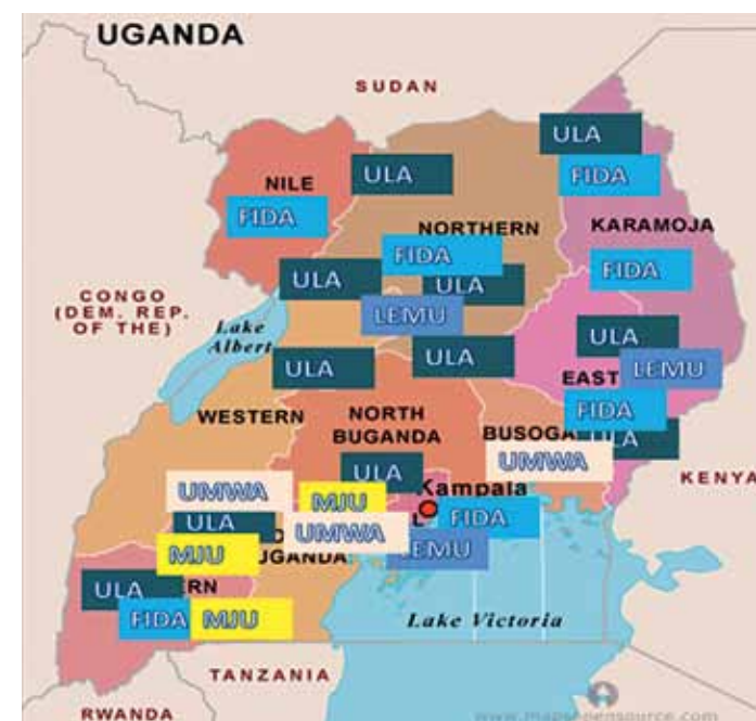
Figure 2. Mapping the CSOs presence in Uganda