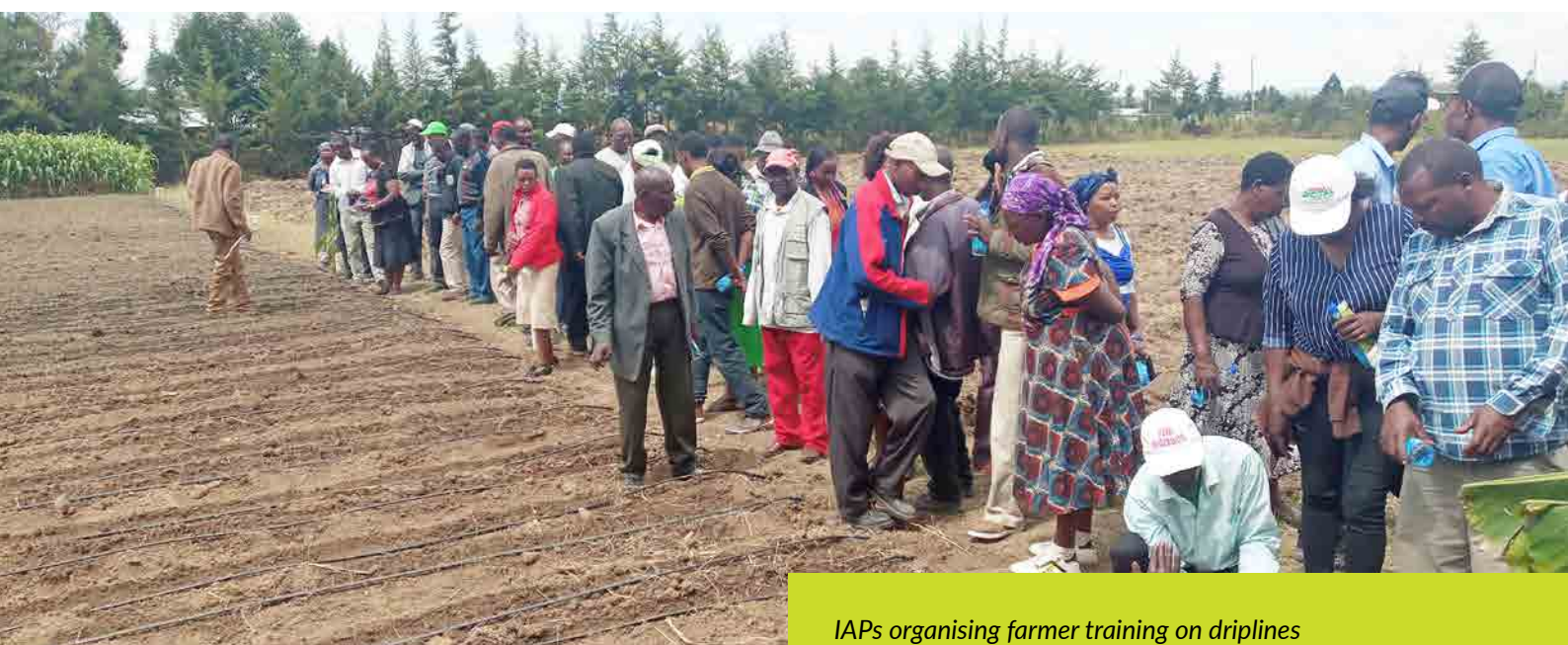
IAPs organising farmer training on driplines (Photo: James Mwangi, September 2019)

All IAPs organized field days to promote SWS options and create business linkages between farmers/farmer groups and SWS providers. Field days have been organized either in university grounds or on farms. Apart from informing farmers of different SWS options, the field days were designed to provide opportunities for businesses to interact with each other and with farmer groups and relevant government agencies. Each county IAP organized six field days on average per year, and brought together over 200 farmers in every event.