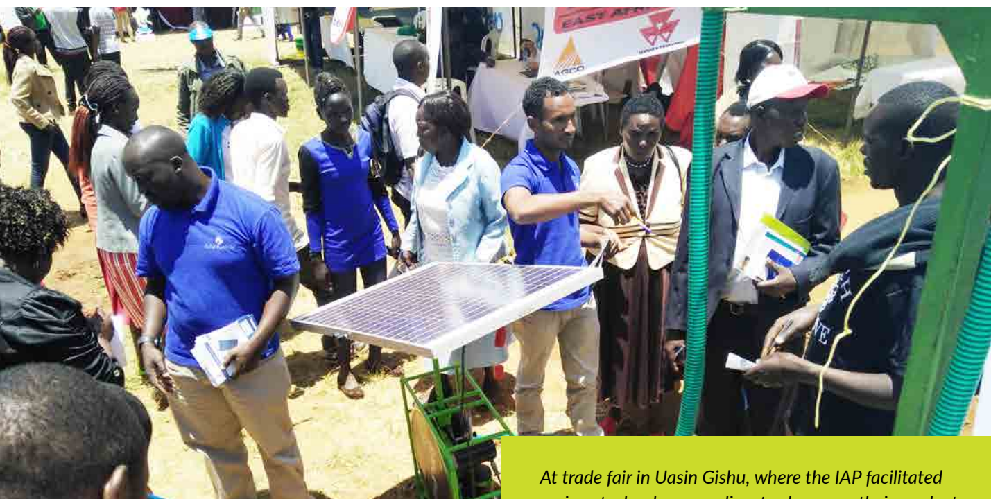
At trade fair in Uasin Gishu, where the IAP facilitated various technology suppliers to showcase their products.

Several IAPs have facilitated member participation in trade fairs and exhibitions. This served the double purpose of promoting the use of county relevant SWS as well as showcasing the work of the IAPs themselves. For example, in Uasin Gishu, IAP members participated in the Eldoret Agribusiness Trade Fair held at the University of Eldoret, which usually has over 10,000 farmers attending. The Meru and Machakos IAPs helped organize the annual County Agriculture Stakeholder Forums – enabling them to highlight SWS to county government representatives. Laikipia and Nakuru IAPs participated in the agriculture shows organized by the respective county governments every year. These shows attract thousands of farmers and present a great opportunity for the IAPs to promote the work of the platform as a whole, as well as the products and services of individual members.