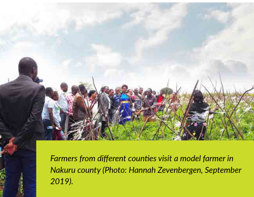
Farmers from different counties visit a model farmer in Nakuru county (Photo: Hannah Zevenbergen, September 2019).

Communication within stakeholder platforms is always critical in maintaining momentum of the platform's activities. All of the project IAPs used SMS and WhatsApp to reach out to their members with information on events and activities, and SWS and their applications. Other forms of communication and information dissemination included email, and radio and tv programmes. In the case of Meru, the IAP engaged WeruTV and WeruFM to share information regarding field days, as well as on how to use the latest technologies, such as flying sensors. The Nakuru and Laikipia IAPs sent out newsletters to members once or twice a year.