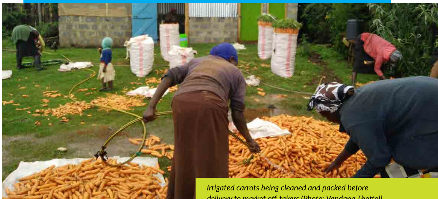
Irrigated carrots being cleaned and packed before delivery to market off-takers

Market off-takers active in exports of green beans, avocados and herbs such as Frigoken, Meru Greens and Vegpro usually face shortage of produce during the dry season in Kenya. These companies have in-house extension service providers, who provide training to farmers on good agricultural practices, and supply the farmers with high quality inputs on credit. During county as well as national IAP events, market off-takers have engaged with technology providers such as SunCulture, Futurepump and Amiran, enabling joint trainings of farmers. While such business linkages have not been in the form of formal contractual arrangements, the companies trained farmers together and helped increase uptake of SWS among the farmer groups. Sunculture has trained farmer groups of Habex Agro, Vegpro and Mace Foods in Uasin Gishu, and has recorded over 271 unit sales from the county.