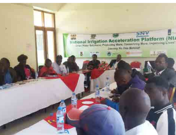
Member consultation on the need to institutionalize the NIAP

At the same time, the platform has considerably increased knowledge of and attention to issues around access to finance for small-scale irrigation and FLID among the institutions involved. This is leading to the development new financial initiatives such as Madaraka currently being piloted by Amiran, which involves an in-house credit facility for inputs and irrigation solutions. Participation in NIAP events has also led to a variety of new business partnerships at the national level, such as between Meru Greens and Musoni for providing loans for irrigation solutions to farmer groups of Meru Greens. Another example can be seen between Acre Africa and Frigoken, in which Acre Africa is provided with historical data on farmers and risks associated with farming by Frigoken in order for them to design specific insurance products.