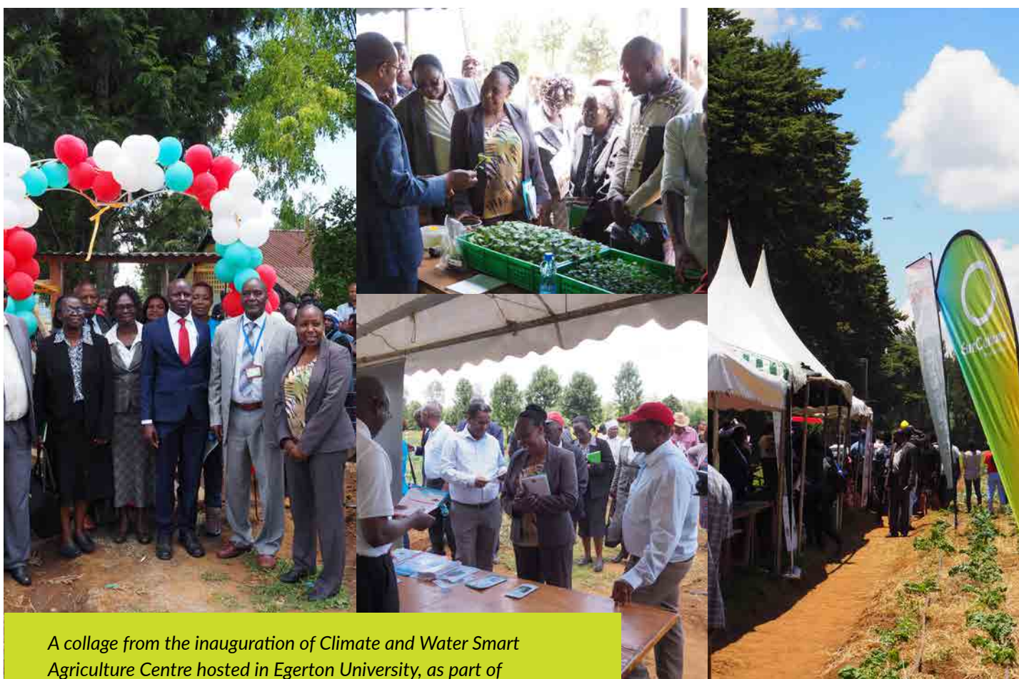
A collage from the inauguration of Climate and Water Smart Agriculture Centre hosted in Egerton University, as part of activities to sustain the Nakuru IAP

Most of the county IAP hosts have been trying to mobilize resources to ensure continuation of the IAP facilitation and activities. This has been quite a challenging endeavour for many, due to the relatively limited time that the IAPs have been active so far.