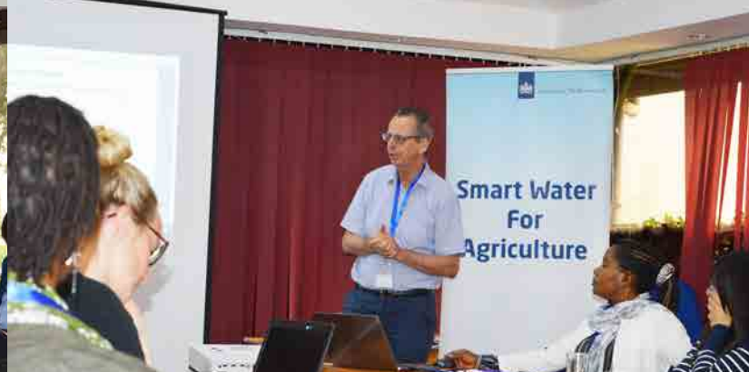
NIAP Masterclasses searching for ways to improve farmer access to finance (Photo: NIAP Secretariat, 2018)