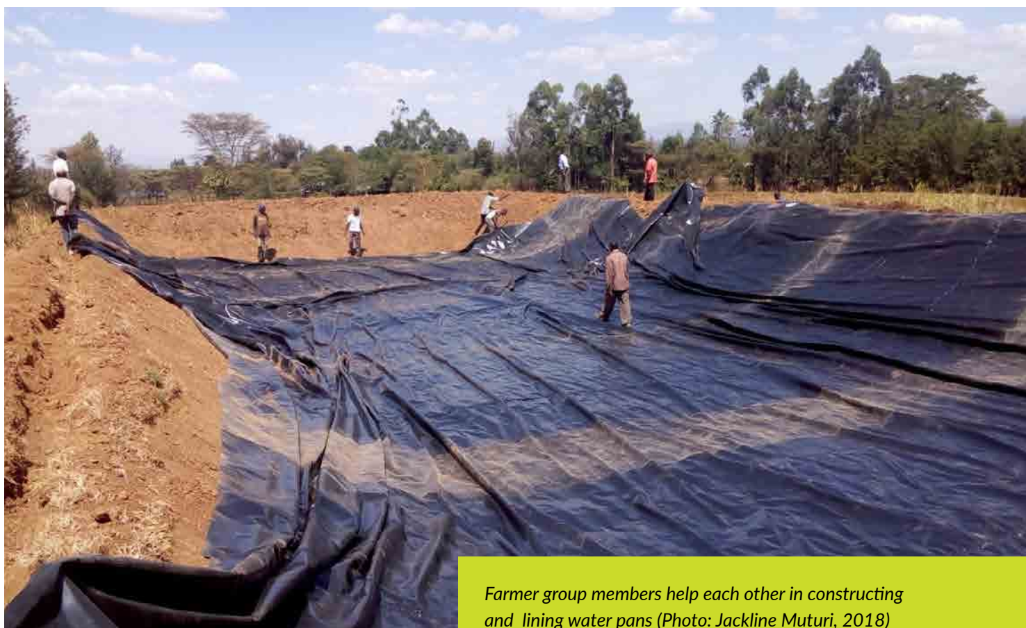
Farmer group members help each other in constructing and lining water pans