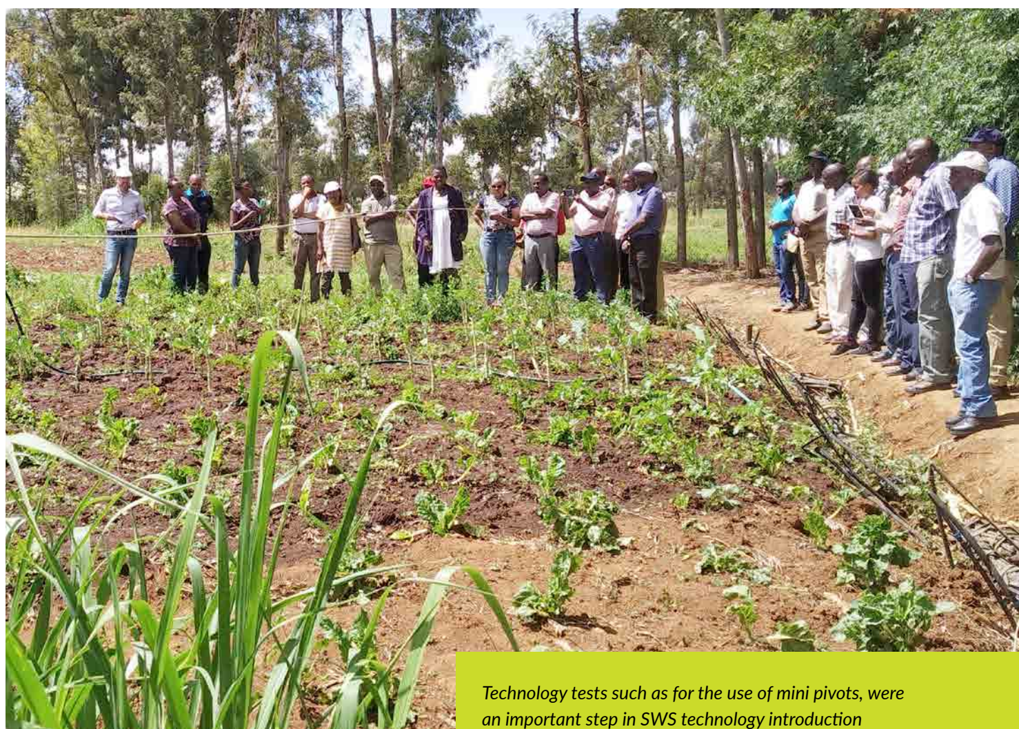
Technology tests such as for the use of mini pivots, were an important step in SWS technology introduction

County IAPs supported the SWA project in organising tests and pilots of new smart water technologies such as the mini pivots, Barsha pumps and Mobile Irrigation Systems. The tests and pilots were organised in the fields of farmers' identified through the IAP, who showed interest in being involved in research and development of new technologies.