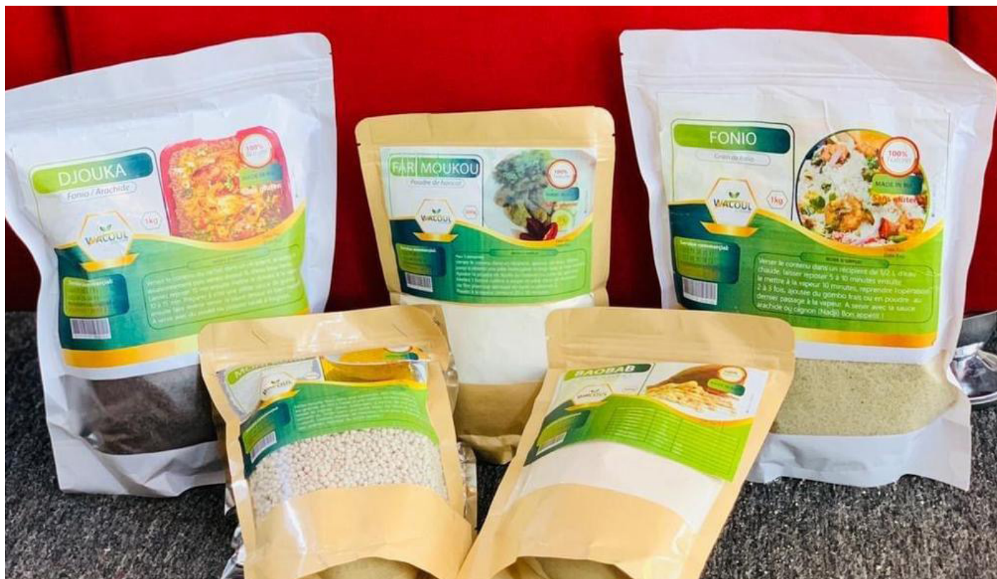
Products of Wacoul Service, Mali