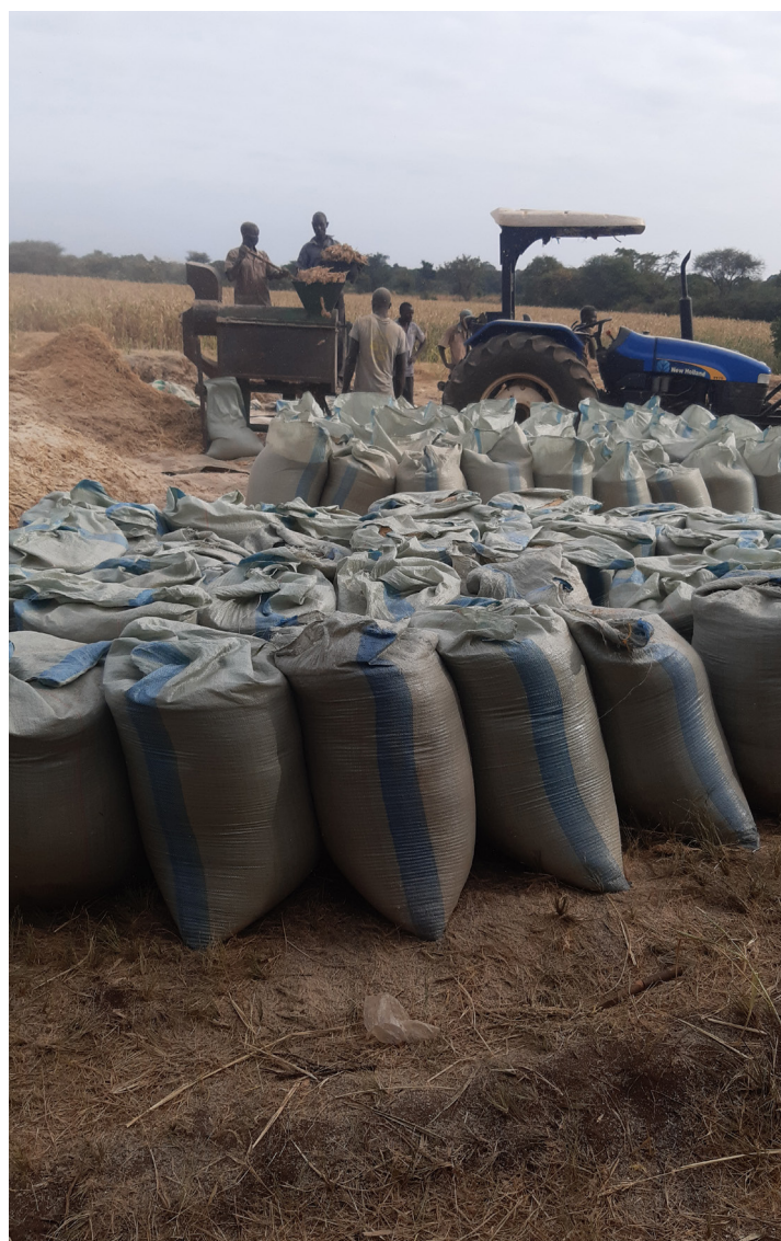
Tegemeo farmers during harvest

Finally, Tegemeo aims to contribute to youth employment in agriculture. The company works with the “Changing Times Youth Group” – a group of 64 young farmers, often agricultural college graduates, who are contracted for seed multiplication, to carry out farmers’ field trainings, and to supply farmers with inputs and agro-chemicals. 39 These youth work based on a commission fee, but also receive a monthly transport support. As such, Tegemeo aims to represent an inclusive business model that serves the nutritional needs of vulnerable groups while also having a positive economic impact on smallholder farmers in the region, particularly youth and women. 40