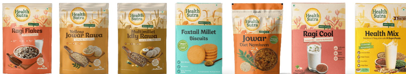
Products under the brand name Health Sutra, by Fountainhead Foods, India.