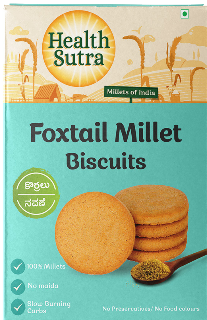
One of the foxtail millet products of HealthSutra

minerals found in Foxtail. Iron is crucial for development of red blood cells in the body, while copper helps enhance the absorption of iron in the body thus improving overall circulation of blood in the body