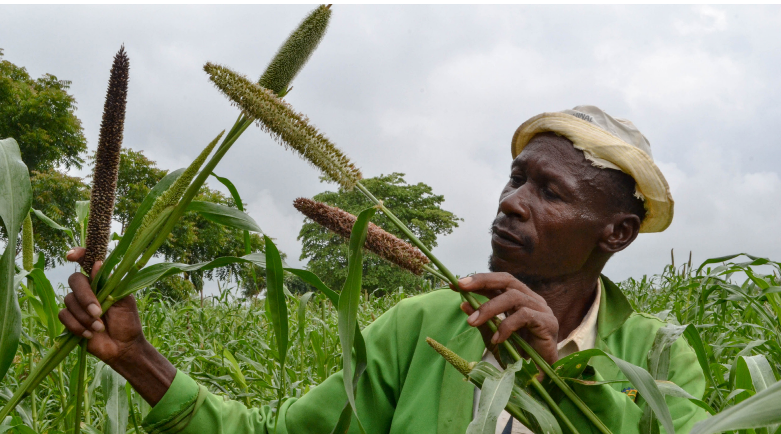
Tegemeo farmer inspecting his millet

The following sections explore production and consumption patterns developing in key millet-producing regions, using examples of national and international ongoing public and private efforts that are affecting these patterns. Development actors, including financiers, can get new insights into the hypothetical (and audacious) question "should we go all in on millet?". While the answer is likely "no", the question is illustrative of the growing number of public nutrition campaigns, processors and brands which, in recent years, have started to aggressively promote millet's nutritional and health benefits.